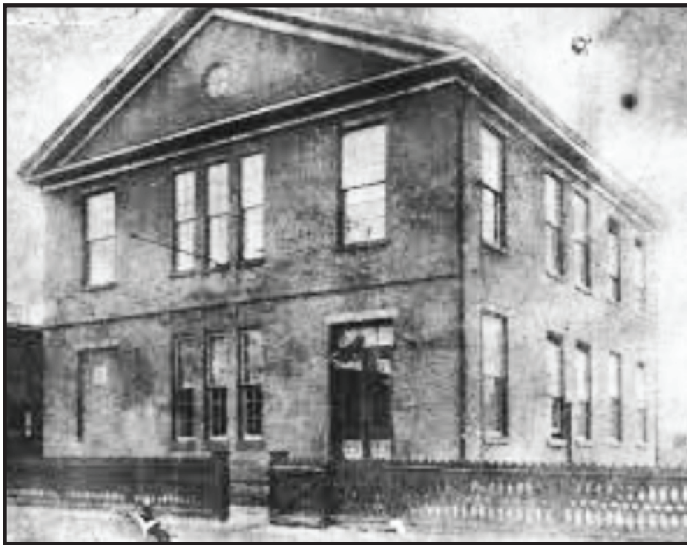
The Higbee School the first school built especially for Trenton's Black children at 20 Bellevue Ave. in 1857.

cultural appropriation and outright theft. Furthermore, they argue the bureaucracy and partners wielding the apparatuses and ownership designed by a dominant disenfranchising culture, have not, and will never serve the grassroots Black community's best interests, apparent in the current violently dangerous